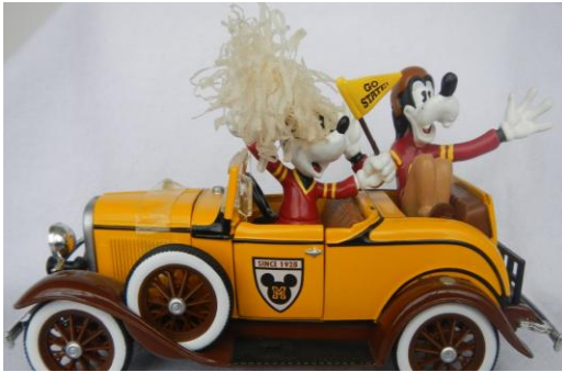
One of the many rare Disney collectibles available for sale and the auction.

The Pine Forge Academy Foundation (PFAF) announced today a unique fundraising event to auction off a rare Manhattan Disney Collection to raise funds to benefit the students of Pine Forge Academy (PFA), one of only four remaining coed boarding academies devoted to developing future African-American leaders of tomorrow. The public will have the opportunity to bid or purchase more than 3,000 rare Disney pieces including art figurines, watches, coins, pins and other rare collections and other non-Disney items from this special collection by a generous benefactor.