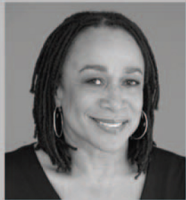
Executive director S. Epatha Merkerson, best known for her role in the NBC television series Law and Order.